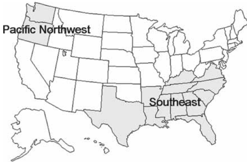
FIG. 1. Survey regions for the production of glued-laminated timbers, lumber, laminated veneer lumber, plywood, and oriented strandboard produced in the Pacific Northwest and Southeast regions of the United States.

multi-unit process approach was modeled for lumber, plywood, and OSB. For specific process descriptions see individual CORRIM reports for each.